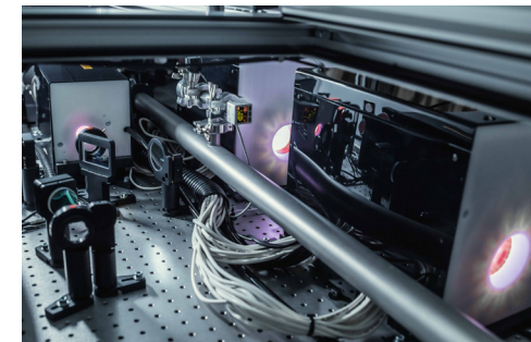
Intermediate and final amplifiers